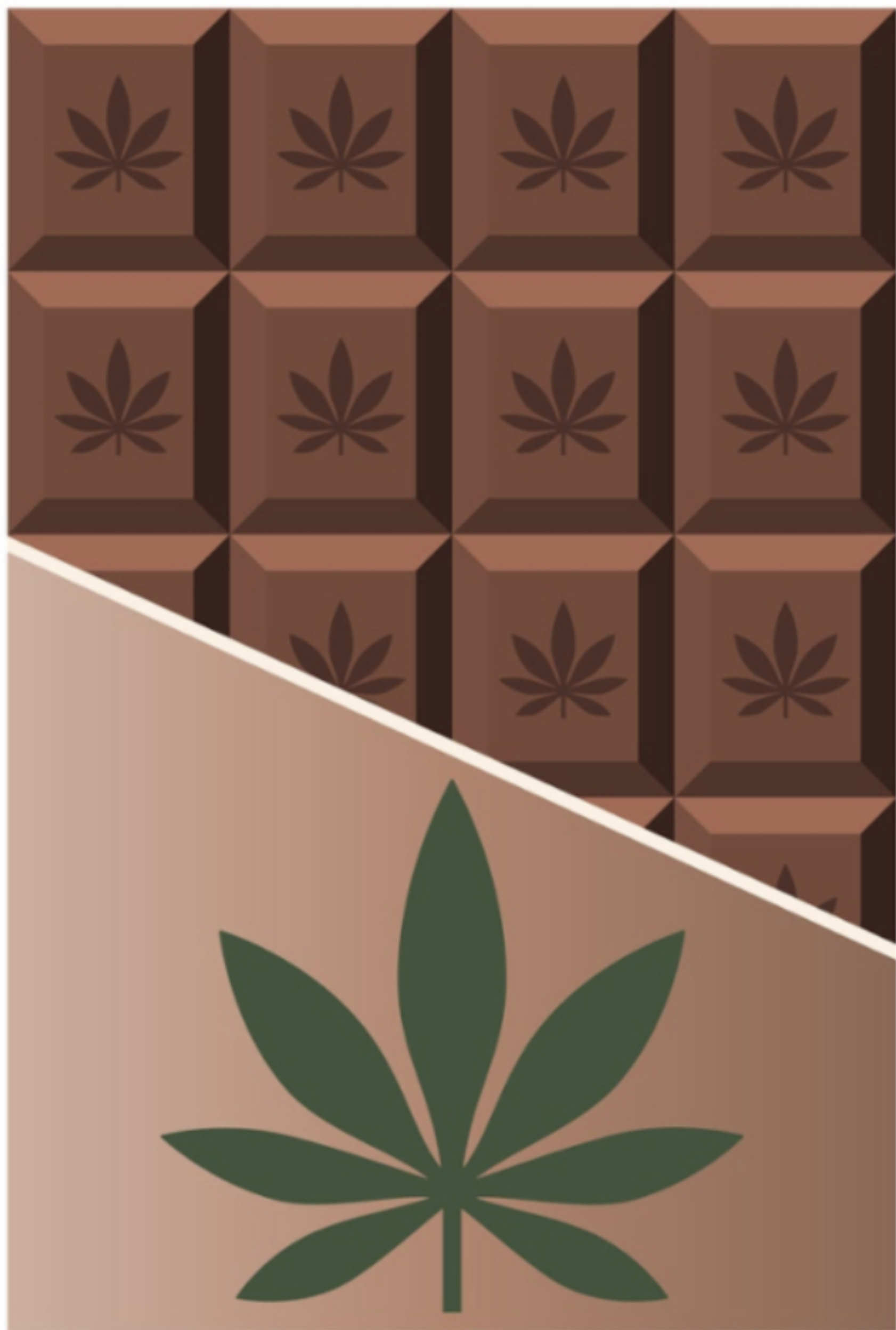
Plain Jane Chocolate Bar