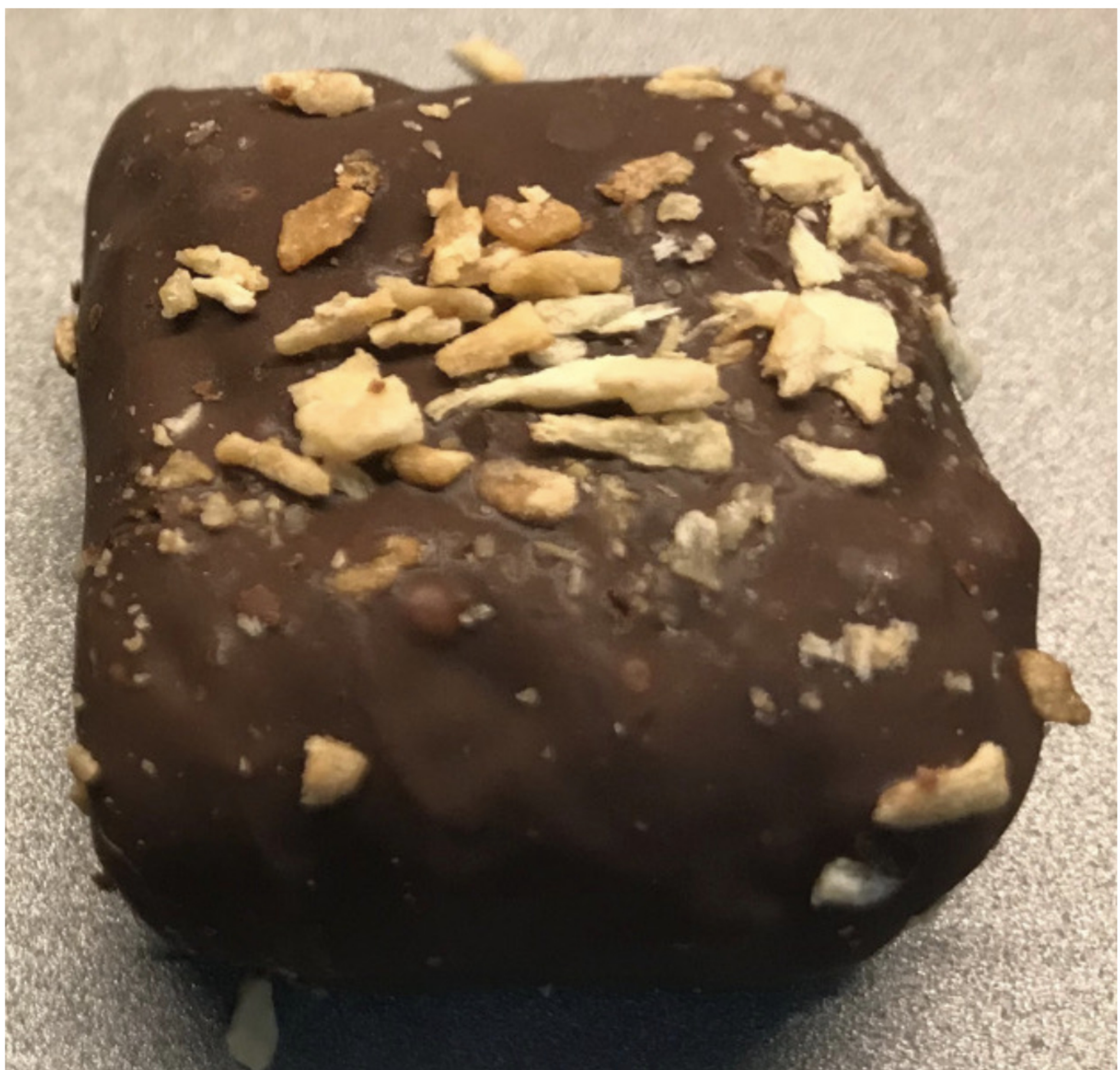
Coconut Almond Toffee Chocolate Bar