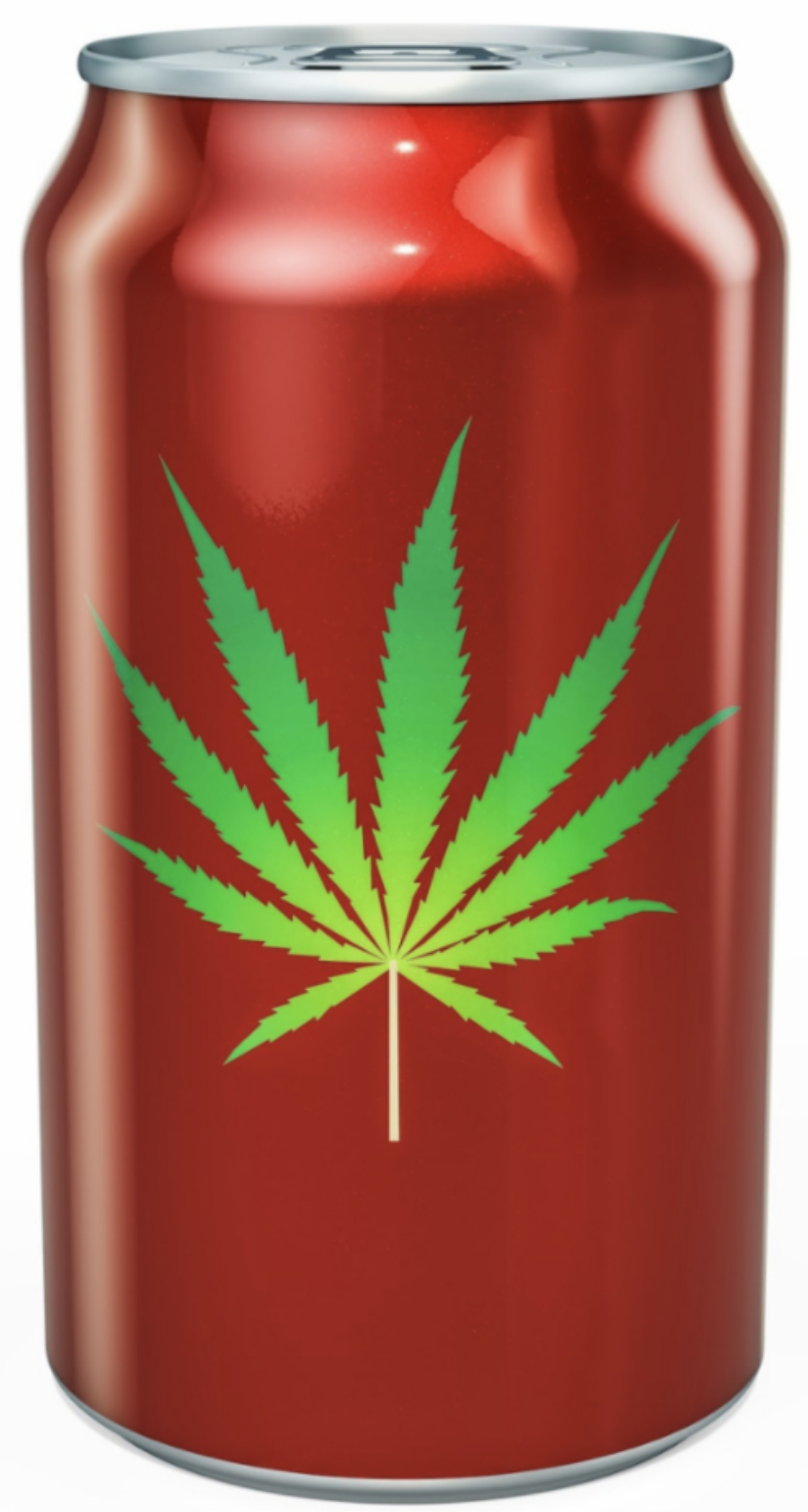
Lime Fizz Beverage