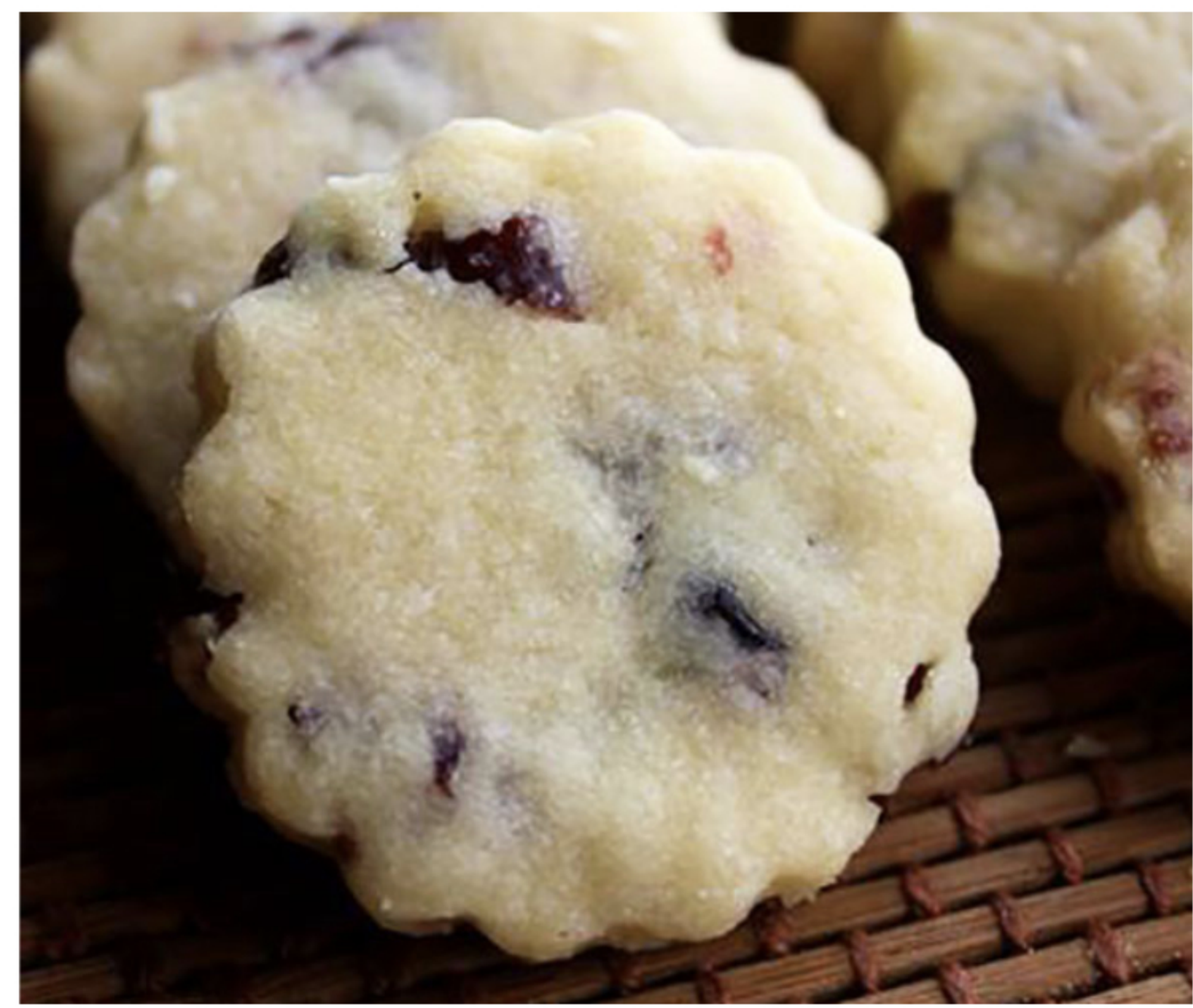
Fog from the Bog Cookie