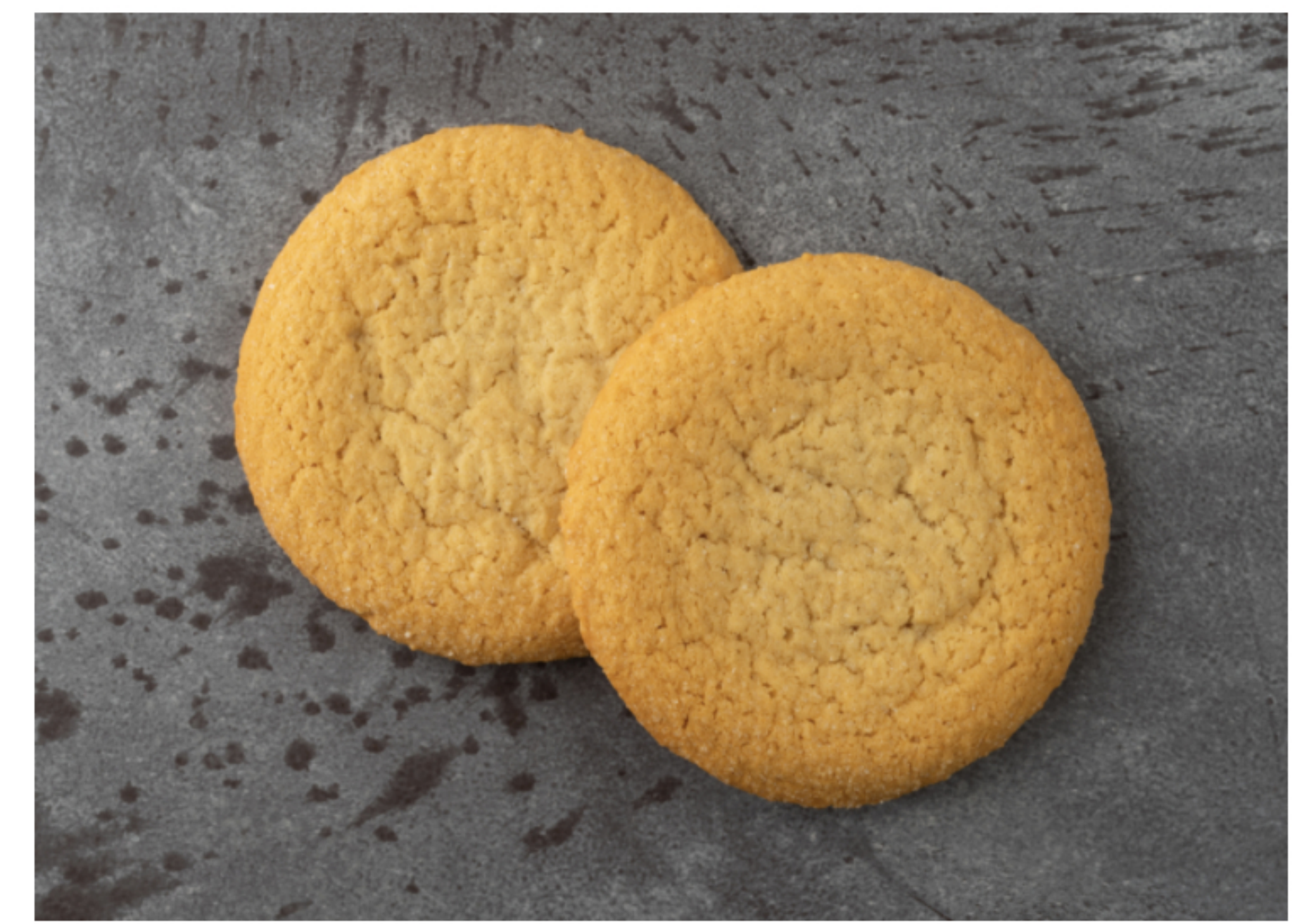
Magic Sugar Cookie