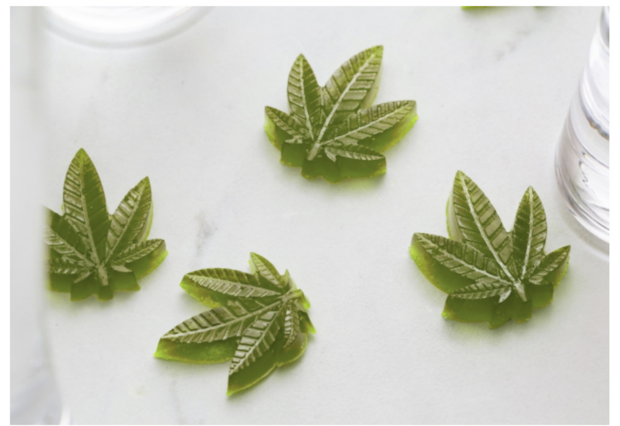
Does the Job Gummy